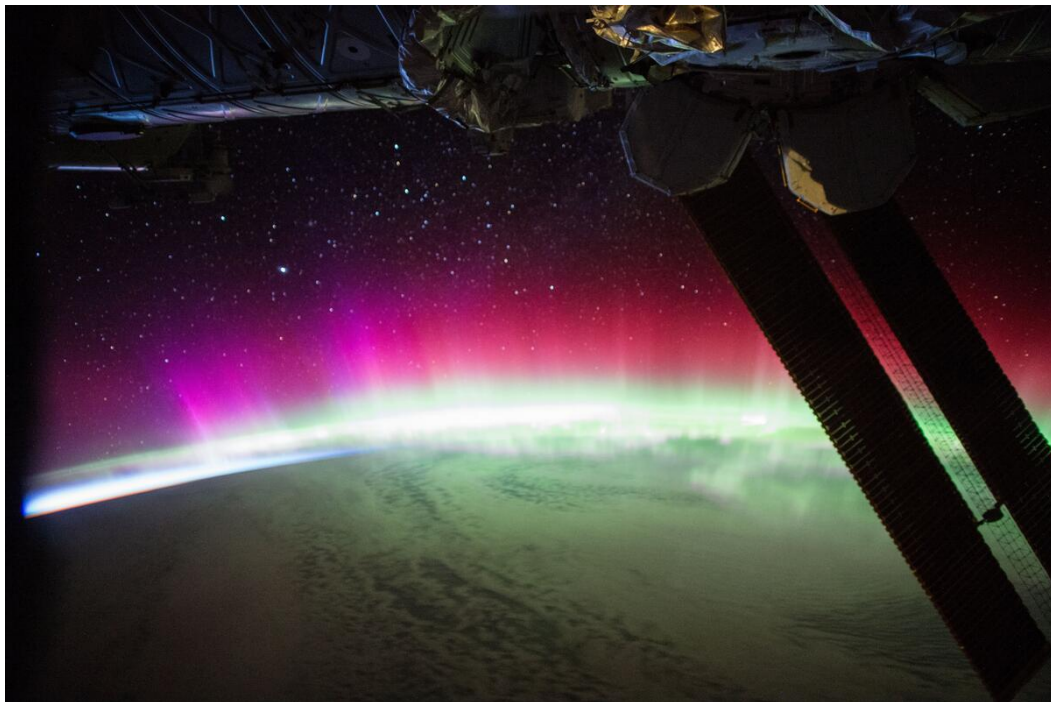
Aurora Borealis as seen from a space station. Whilst space cannot be divided into civilian and military parts, the area of 'military space' will feature the traditional powers of the US, Russia and China but also see the addition of new players, such as India.

Future military operations between peer competitors will be characterized by a Multi-Domain Operations (MDO) approach, which feature the integrated and parallel use of air, sea, land, cyberspace and space. Across the spectrum of military operations, from low-tempo peace-keeping missions and security force assistance to high-intensity, high-tempo warfighting operations, the military will make use of all operational domains—but particularly the space domain. Space has become vital to modern military activity as the speed of operations has increased and led to compressed time-cycles for decision-making at the command and control (C2) and tactical levels. [1]