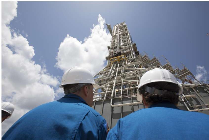
Close-up view of a mobile launcher at NASA's Kennedy Space Center in Florida. The military use of space should take the protection of ground-based infrastructure into account.

Improved SSA provides a more accurate picture of space and facilitates calculations concerning proximity of assets in space. This will assist in developing a space traffic management system to prevent collisions. Improved SSA will lead to the reduction of a satellite's safe bubble as it is constituted and in turn this will reduce the propensity for evasive manoeuvring while offering safer ways to achieve and maintain safe navigation and mobility in space. By also enabling space traffic management, the security of space-based systems will be enhanced, prolonging satellite lifespans and support better planning for replacements, upgrades and new insertions.