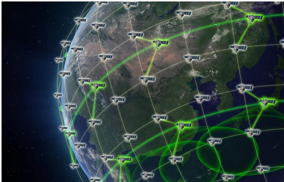
Artist's concept of a network of satellites. Congestion is a serious threat in space, particularly in Low Earth Orbit (LEO).

At the same time, Europe's own resolve to attain strategic autonomy and sovereignty may grow stronger and extend to its future space strategy. Geopolitical factors and increasingly easier and cheaper access to space are likely to continue introducing new players into the frame, pursuing the strategic and tactical use of space, operating satellites and developing ground-based enabling infrastructure. [7] Whilst space cannot be divided into civilian and military parts, the area of 'military space' will feature the traditional powers of the US, Russia and China but also see the addition of new players, such as India, the UAE and others like the EU and/or its individual member states.